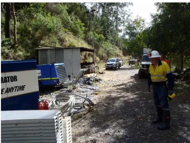
Photo 2 Mobilised drill rig on site at RoD, in adit